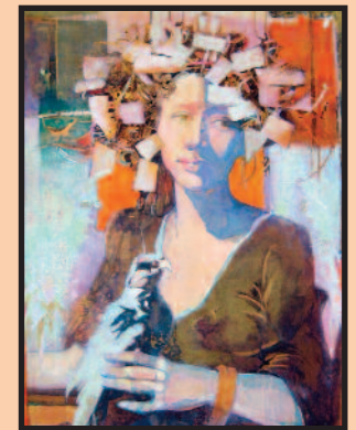
Best in Show, FWS, 2010